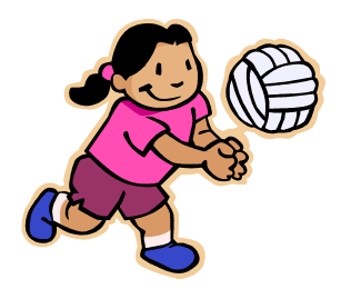
Boys & Girls After-school Program

The Boys & Girls After-school Program is searching for a part-time assistant coach who plays sports and enjoys helping children. Athletic, reliable, and energetic individuals are encouraged to apply.